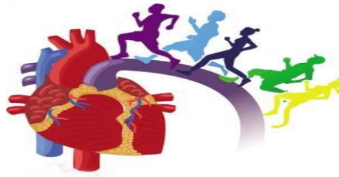
Figure 2 Coronary heart disease

Add exercise therapy to routine drug therapy and diet therapy for scientific and effective rehabilitation exercise. According to the current study, exercise therapy can promote the rehabilitation of patients with coronary heart disease more quickly. Exercise treatments are also varied, such as: playing tai chi, playing badminton, jogging, walking, swimming and other aerobic exercise, if the patient's condition is more serious, can be guided by the doctor's advice to carry out suitable exercise for patients.