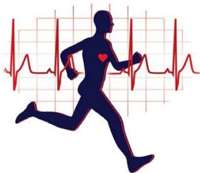
Figure 3 Sports

Effects on blood pressure: aerobic exercise is proposed by kenneth, a leading fitness expert in the united states. In 1989, WHO and the International Institute of Hypertension first recommended aerobic exercise. is a non-pharmacological hypotensive method. Zhang Xiaofang's study found that exercise therapy could prevent and treat damage to vital organs such as the heart, brain and kidney caused by coronary arteries. Heart disease and high blood pressure. Aerobic exercise can make the capillaries in muscle exercise open in large quantities, thus reducing the resistance of the surrounding blood and making the blood less. Certainly, improve cardiac natriuretic peptide secretion, cardiac natriuretic agent, sodium excretion effect, thereby further lowering blood pressure. Systolic blood pressure should pay special attention to the change of blood pressure during exercise, because studies have shown that the main change of blood pressure during aerobic exercise is systolic blood pressure, if the systolic blood pressure does not rise, but is falling, indicating that the patient has heart disease and other problems.